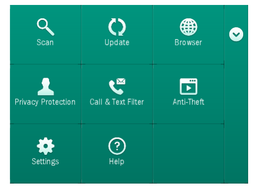
Figure 4. Quick launch panel

The quick launch panel provides quick access to the main app functions (see figure below).