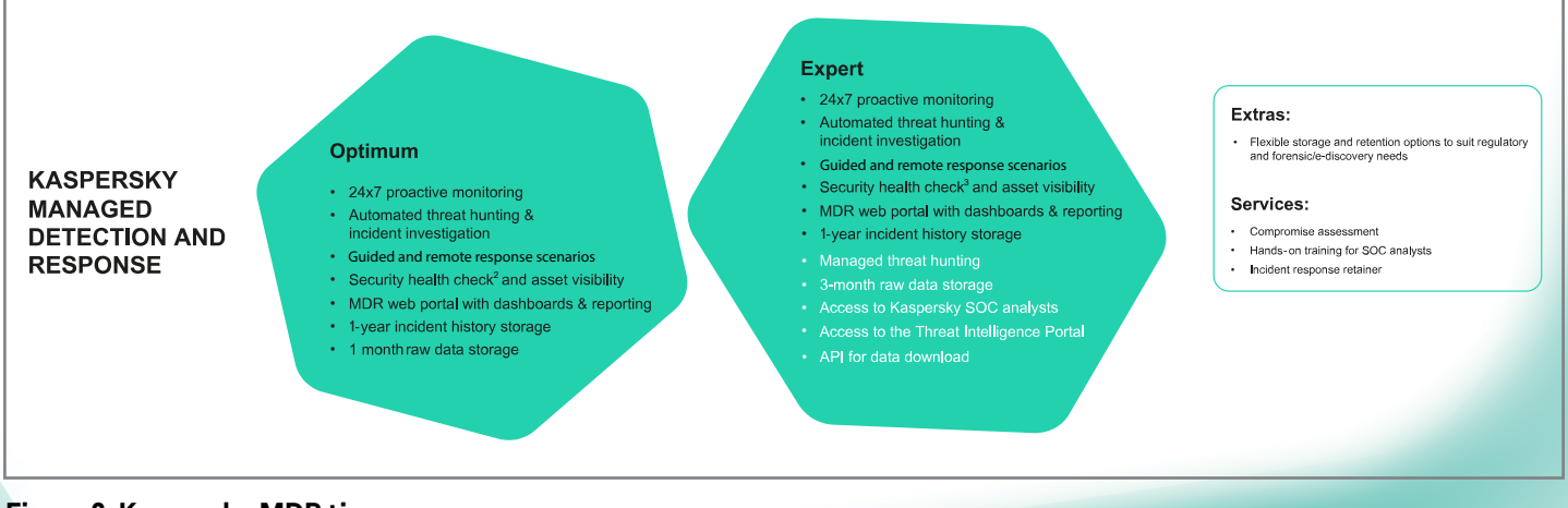
Figure 2. Kaspersky MDR tiers

Kaspersky MDR features two tiers to suit the needs of organizations of every size and industries with varying IT security maturity levels (Figure 2). Kaspersky MDR Optimum instantly raises your IT security capability without the need to invest in additional staff or expertise and provides resilience to evasive attacks through its fast, turnkey deployment. Kaspersky MDR Expert includes all the features of Optimum and provides extended functionality and flexibility for mature IT security teams, enabling them to offload incident triage and investigation processes to Kaspersky and focus their limited in-house IT security resources on reacting to the critical outcomes delivered.